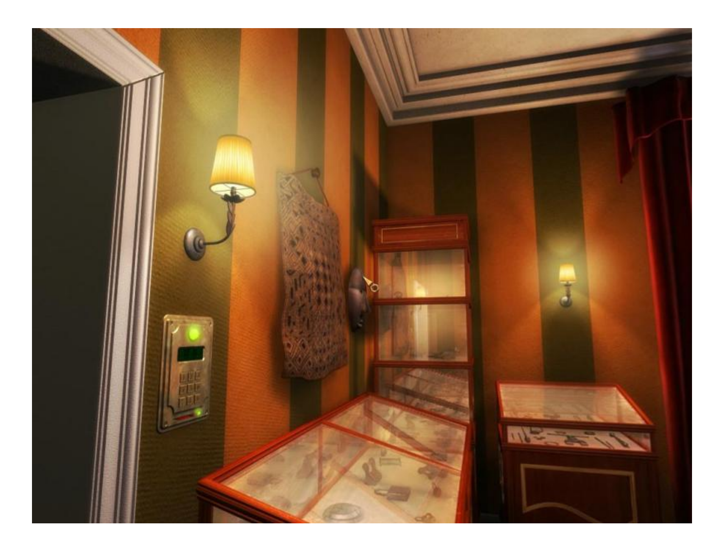
Download ->->-> http://bit.ly/2SJA8JL

Safecracker: The Ultimate Puzzle Adventure Free Download [Torrent]